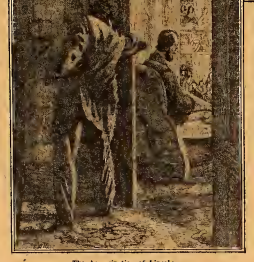
The Assassination of Lincoln.

SECRET OF LINCOLN'S POWER. Natural Development of the Man Through Failure and Success. It is a strange thing that the man who was to be the greatest of our nation should have been born in a poor and obscure family.